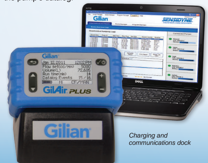
Charging and communications dock

The GilAir Plus dock provides charging and communication functions for the STP and data-logging models. Once docked, the PC application allows users to review datalogs, generate sampling reports, manage sampling programs, and create pump set-up profiles that expedite deployment of large pump fleets. The SmartCal SM feature uses the dock as a communication link between appropriate calibration devices and the GilAir Plus. SmartCal SM automates calibration and records pre and post sample calibrations in the pump's datalog.